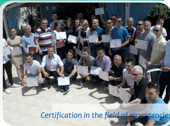
Certification in the field of emergencies

"BIZNESI" College also cooperates with economic organizations. There is a good cooperation with the Chamber of Commerce of the Republic of Kosovo in the exchange of ideas regarding the economic and social development of Kosovo. "BIZNESI" College has good cooperation with Trade Union Organization.