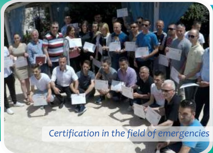
Certification in the field of emergencies

"BIZNESI" College also cooperates with economic organizations. There is a good cooperation with the Chamber of Commerce of the Republic of Kosovo in the exchange of ideas regarding the economic and social development of Kosovo. "BIZNESI" College has good cooperation with Trade Union Organization.